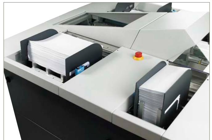
Sheet and insert feeders hold 1,000 and 1,500 items respectively